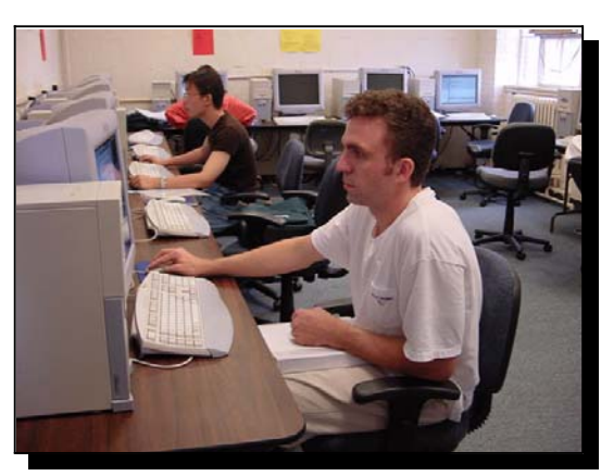
Students love the new Sun Unix stations in Withers 400