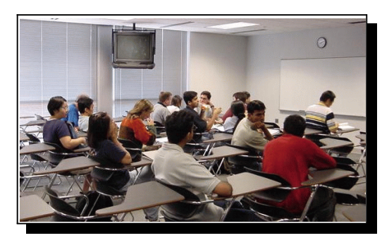
Students wait for the first class in Venture II to get underway.

On August 21, 2000, the first Computer Science classroom on Centennial Campus opened. Students packed the eighty-six