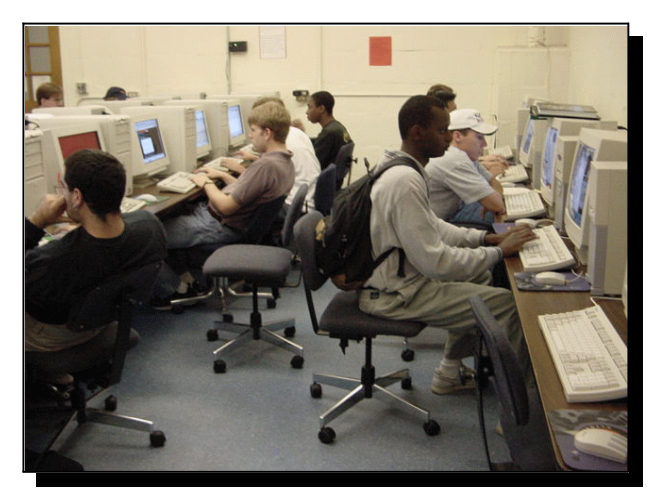
In the EOS Computer Lab at Withers Hall, Students work on projects, complete homework, and check email. Rarely is there an empty seat in the room.