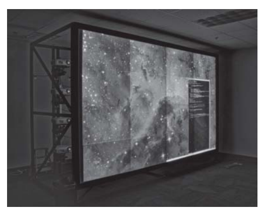
The RENCI at NC State visualization wall (14 feet by 8 feet).

With the opening of RENCI at NC State, faculty and staff on the NC State campus now have access to RENCI resources, staff and collaborators and have the opportunity to contribute to these