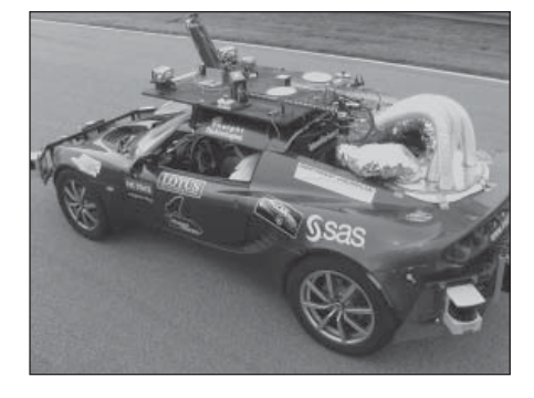
Insight's Lone Wolf set an autonomous vehicle record.

Editor's Note: The NC State Department of Computer Science has played a vital role in this partnership through the support of our Senior Design Center student project teams. Over the past two years, numerous project teams have helped develop and refine the software required to control the driverless vehicle in the DARPA Grand Challenge. Corporate partners Cisco Systems and Northrop Grumman have also played a key role in the process, providing sponsorship support for the teams working on the related projects. SDC project teams are expected to, once again, be involved in the evolution of the software for the DARPA Urban Challenge.