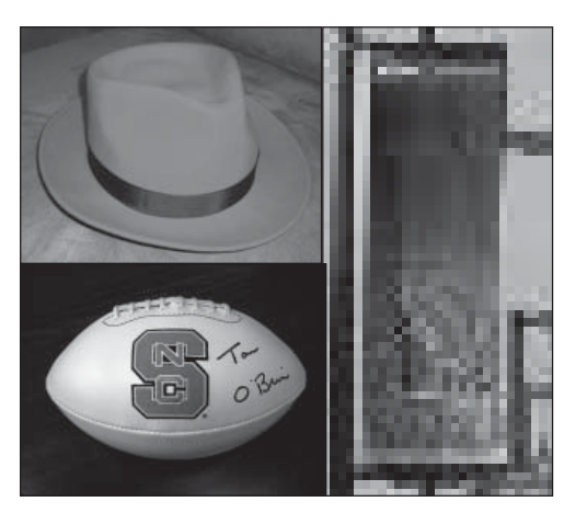
Some of the items included in the online auction.

For more information, or if you would like to be involved in any of the 40th Year Celebration events and activities, contact Ken Tate.